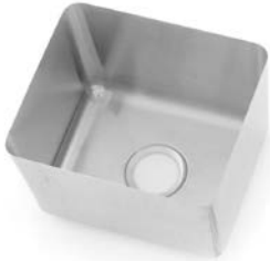
Hand Fabricated Bowl