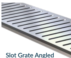
Slot Grate Angled