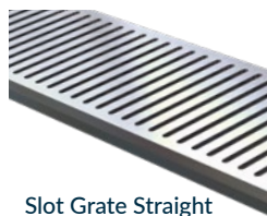
Slot Grate Straight