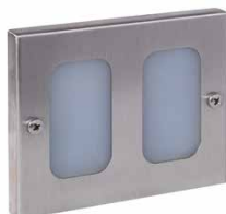
CS-TFP - Replacement Front plate available