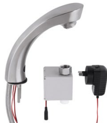
Hob Mount Infrared Sensor Tap