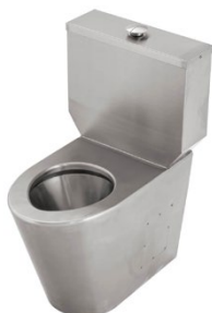
Ambulant Wall Faced Close Coupled Toilet Pan