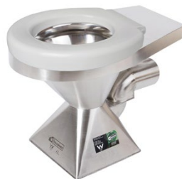
Pedestal Toilet Pan with Seat