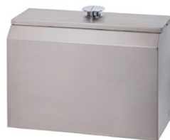
Stainless Steel Disabled Compliant Dual Flush Cistern