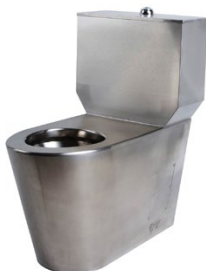
Disabled Compliant Wall Faced Close Coupled Toilet Pan