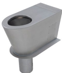
Disabled Compliant Long Drop Toilet Pan