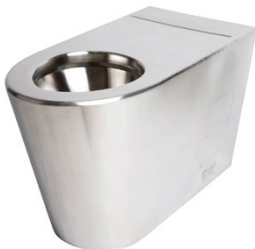
Disabled Compliant Wall Faced Toilet Pan