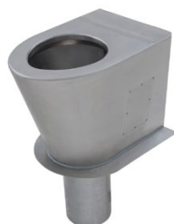
Ambulant Long Drop Toilet Pan