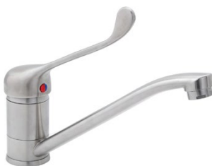
Stainless Steel Lever Handle Swivel Sink Mixer