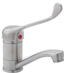
Stainless Steel Lever Handle Basin Mixer