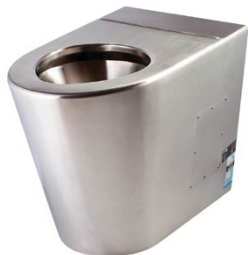
Ambulant Wall Faced Toilet Pan