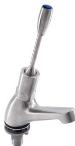
Lever Handle Pillar Tap