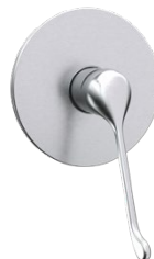
Stainless Steel Lever Handle In Wall Mixer