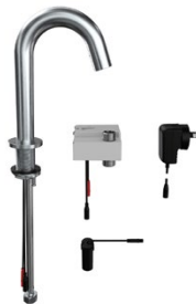
Gooseneck Bench Mounted Sensor Tap