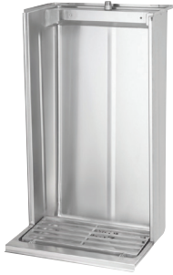
Deluxe Slab Urinal